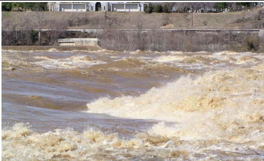
The James River off Belle Isle at 18.5 feet, Feb 24, 2003 (Flood stage is at 9 ft).

The recent flood season along the James is a welcome relief to the long standing drought. The down side? More trash from road sides and ditches dumped into the river-we can expect more in this summer's clean-up!